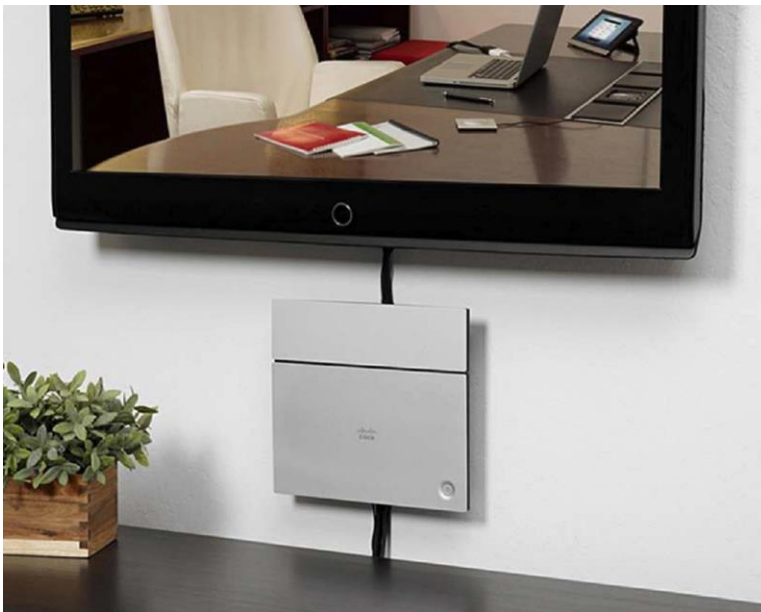
Figure 2. Cisco TelePresence SX20 Quick Set on Optional Wall Mount